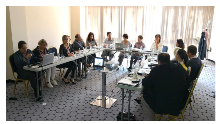
3rd International Meeting of the Sustain-T Project

On 4 and 5 October, the partners involved in the Sustain-T project met at their Third International Meeting in Bulgaria, specifically in Sofia.