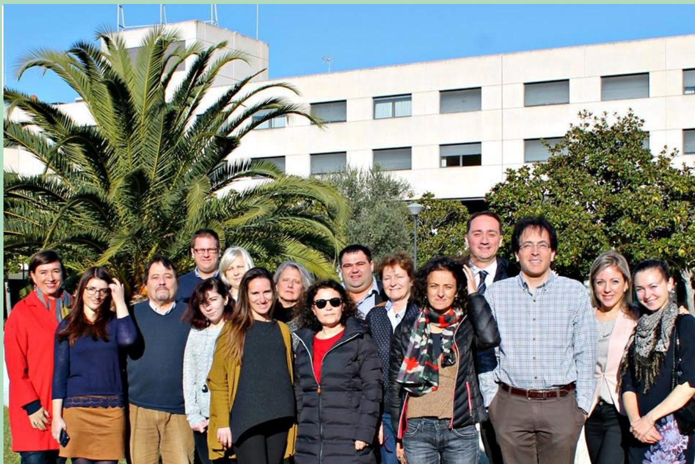
Sustain-T Project Team