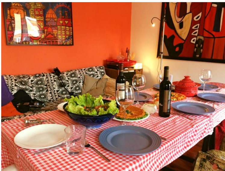
Syrian lunch organized for the recordings of "Tomorrow is Better"

The RefugeesIN project contributes to the challenges identified in the Europe 2020 initiatives, as well as in the European Plan for Adult Education, which highlights the need for a more inclusive and cohesive EU.