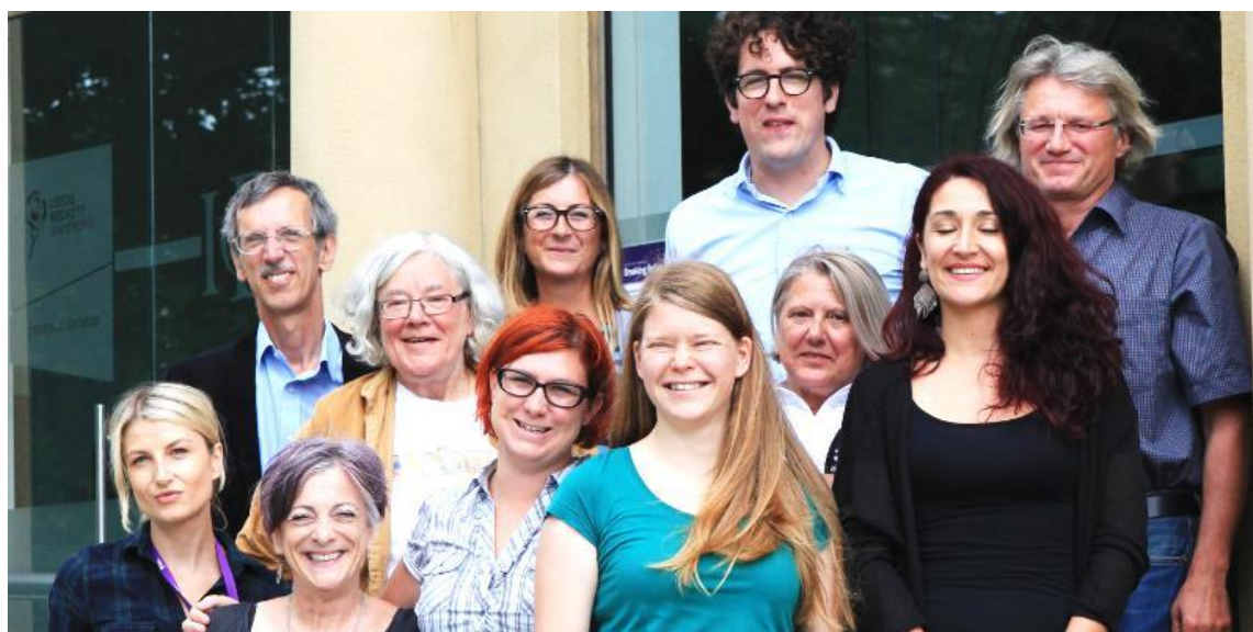
CINAGE team, project coordinated by AidLearn