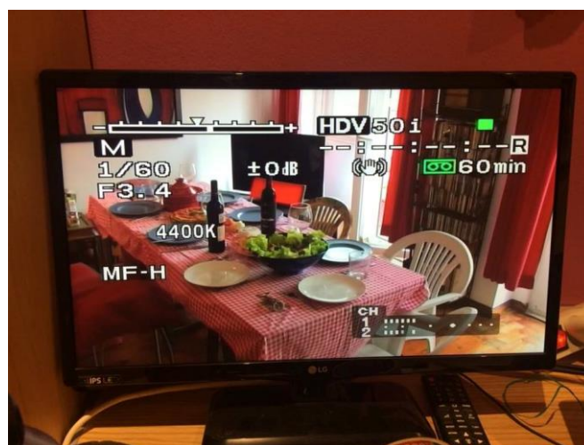
Footage of "Tomorrow is Better" Lunch