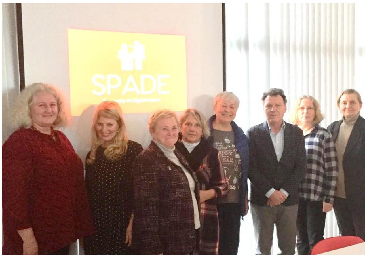
Team SPADE in Lisbon, Portugal