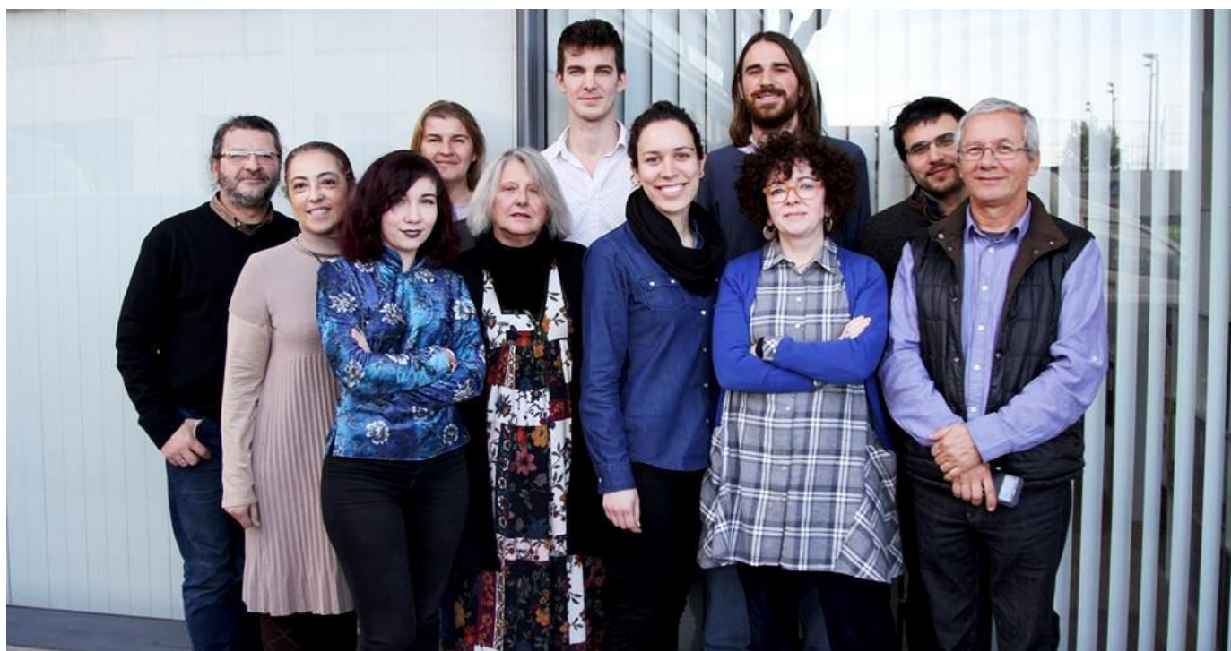
Portuguese Pilot Group of the RefugeesIN Project