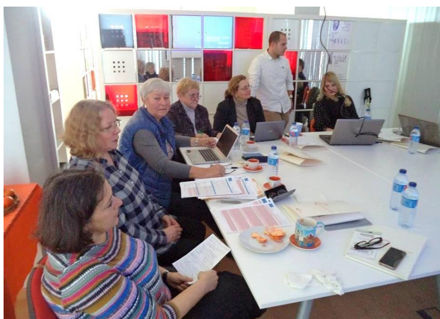
SPADE team meeting at AidLearn in Lisbon, Portugal.

All the partners, duly represented, participated in the event. These are: AidLearn (Portugal), Volkshochschule Stuttgart (Germany), Norrköpings Stadsmuseum (Sweden), Die Wiener Volkshochschulen (Austria), PRO-MED (Poland), Balcă Agency for Sustainable Development (Bulgaria), Associazione Nestátních Neziskových Organizací Jihomoravského Kraje (Czech Republic) and the coordinating partner Poleski Ośrodek Sztuki (Poland).