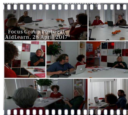
RefugeesIN Focal Group – Portugal, AidLearn

The final meeting of the Portuguese focal group was held on 28 April 2017 at the headquarters of AidLearn in Lisbon, which selected two feature films to be included in the RefugeesIN Catalogue. FATIMA , 2016 by Philippe Faucon and DHEEPAN , 2015 by Jacques Audiard.