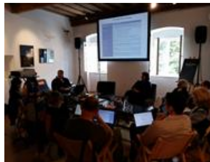
2nd SILVER CODE Project Meeting, Ljubljana, Slovenia

If you are interested in joining Silver code training, which is free of charge, please do not forget to give us your contact data at the end of the questionnaire. See all the information on the project website and follow us on Facebook !