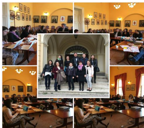
2 nd GREEN TOUR Project meeting, Godollo, Hungria

The second meeting of the Green Tour project was held in Godollo-Hungary at Szent Istvan University on the 27 th and 28 th April 2017.