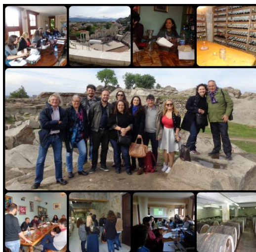
Third project meeting, 8th and 9th May 2017, Plovdiv, Bulgaria

Very soon the Executive Summaries will be available on the project website.