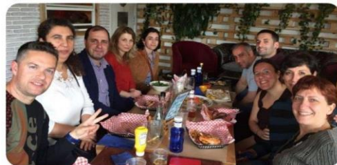
4 th CREATUSE Project meeting, Madrid, Spain