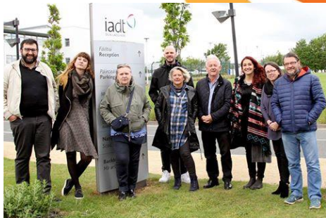
2 nd Meeting of RefugeesIN Project, Dublin, Ireland

The second meeting of the RefugeesIN project was held on the 18 th and 19 th May. The partnership agreed on the first two outputs finalisation and detailing the stages for completion the RefugeesIN Course. Was also the time for a guest speaker to analyse the situation of the Refugees in Ireland.