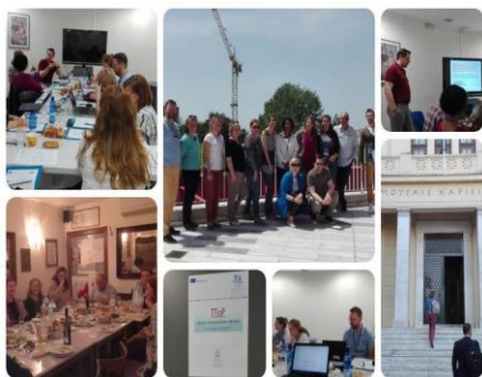
2ª TTOP Project Meeting, Thessaloniki, Greece

The second meeting of the TTop took place at Aristotelio Panepistimio University in Thessaloniki, on 27th and 28th April.