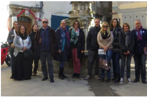
1st Meeting of Project BACCHUS SME, Forcalquier, France