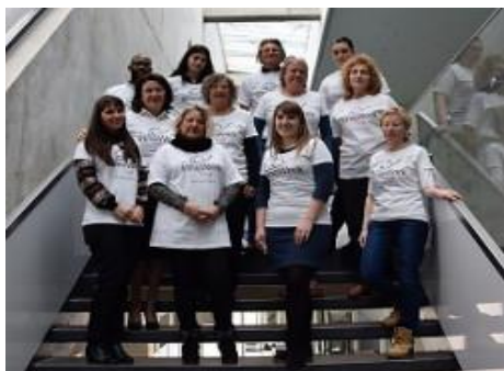
4 th InnoWork Project Meeting, Kaunas, Lithuania

In the 2 nd transnational meeting of the project, held at AidLearn premises (15/16 April 2016), were presented the Good Practices of Sharing Economy in Urban Environment, collected by the partners, which will soon be available online.