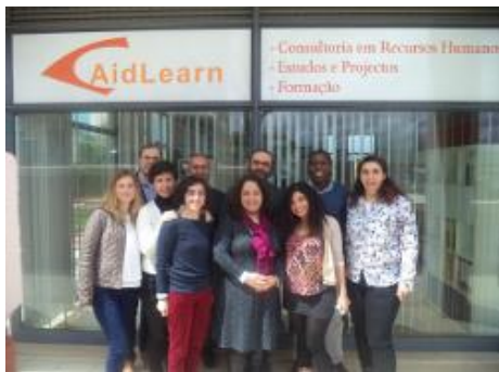
2 nd CREATUSE Project Meeting, Lisboa, Portugal